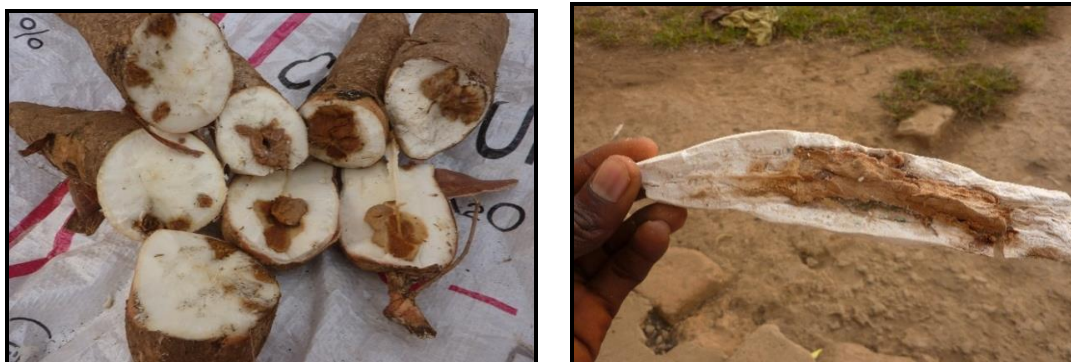
Figure 1. Typical CBSD-like root necrosis as observed in northern Angola (in fresh and dry roots)

Incidence = (number of diseased plants) / (number of plants observed) x 100.